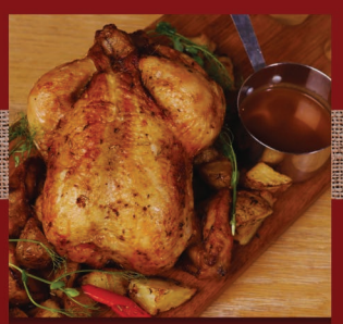
Whole Herb Marinated Chicken with Vegetables (1.2kg - 1.5kg) PHP 1.800++