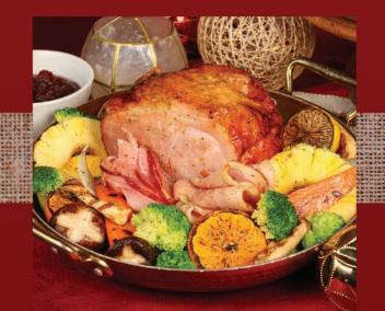
Honey Cured Ham with Vegetables (1kg) PHP 3.000++