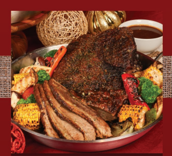
Smoked Beef Brisket in BBQ Sauce (700g) PHP 2,500++