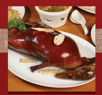
Whole Imperial Peking Duck with Chinese Pancake (2kg - 22 kg) PHP 5.888++