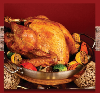
Whole Roasted Turkey with Cranberry Sauce (4.5kg) PHP 5.600++