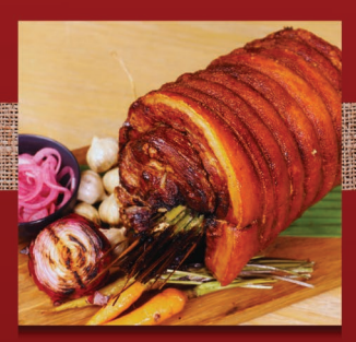
Air-Dried Lechon Belly Roll with Vegetables (1.2kg) PHP 2.000++